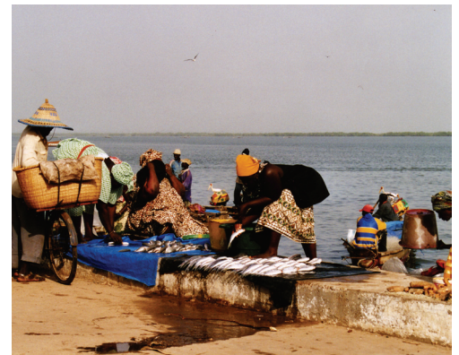
Senegal: the country's debt has been rescheduled 14 times.

On average, metrics such as total debt/exports and average interest rates have improved in both low and middle income countries since the 1990s (see Table 1 and Box 1 for background information). Debt as a percentage of GNI (Gross National Income) in middle income countries has been reduced slightly after a peak during the financial crises of the 1990s, and has decreased substantially in low income countries due in no small part to debt forgive-